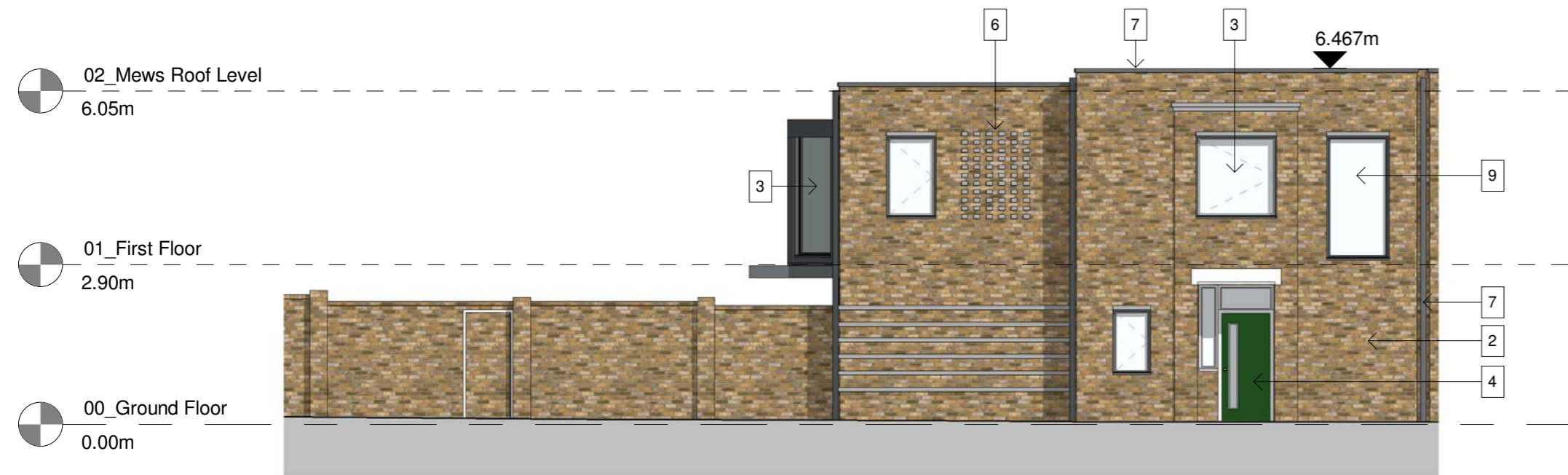
Mews Elevation 1 1 : 100

Notes This drawing may be scaled for the purposes of Planning Applications, Land Registry and for Legal plans where the scale bar is used, and where it verifies that the drawing is an original or an accurate copy. It may not be scaled for construction purposes. Always refer to figured dimensions. All dimensions are to be checked on site. Discrepancies and/or ambiguities between this drawing and information given elsewhere must be reported immediately to this office for clarification before proceeding. All drawings are to be read in conjunction with the specification and all works to be carried out in accordance with latest British Standards / Codes of Practice.