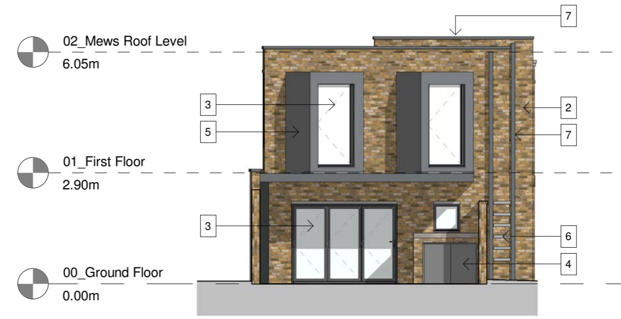
Mews Elevation 2 1 : 100